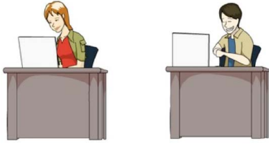
Figure 3. Jane, the female affective learning companion, and Jake, the male affective learning companion.

emotional state; this model is derived from data obtained from a series of studies [1, 4].